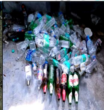
Plastic and Glass Bottles are segregated