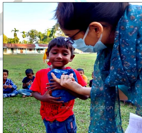
Distribution at Roypara & Kailashpur Tea Estate Area