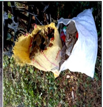
Plastic Waste Collection